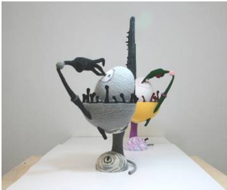
Oehme, Annett: Traum an/ gehäkelt/ 2006/ 35 x 25 x 55 cm Traum aus/ gehäkelt/ 2008/ 35 x 25 x 55 cm