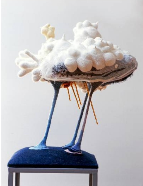
Oehme, Annett: Wolke/ gehäkelt/ 2005/ 50 x 56 x 90 cm